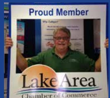
Culligan Lake of the Ozarks