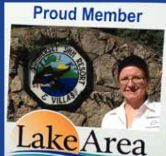
Summerset Inn Resort & Villas