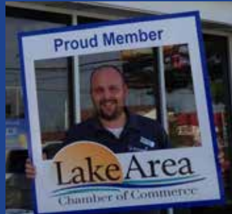
Jiffy Food Mart - Osage Beach