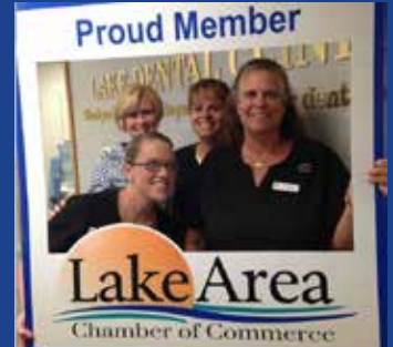
Lake Dental Clinic