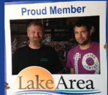
Camdenton Recycling Center