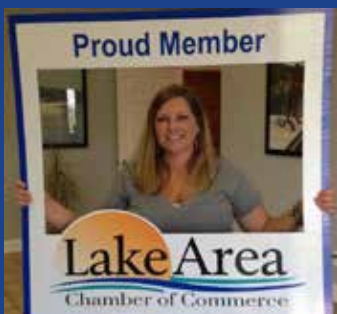
K & R Wholesale