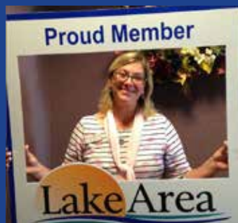
First National Bank - Camdenton