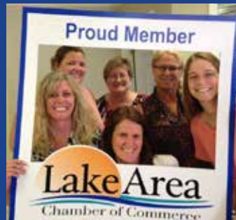
McGrath Insurance Group